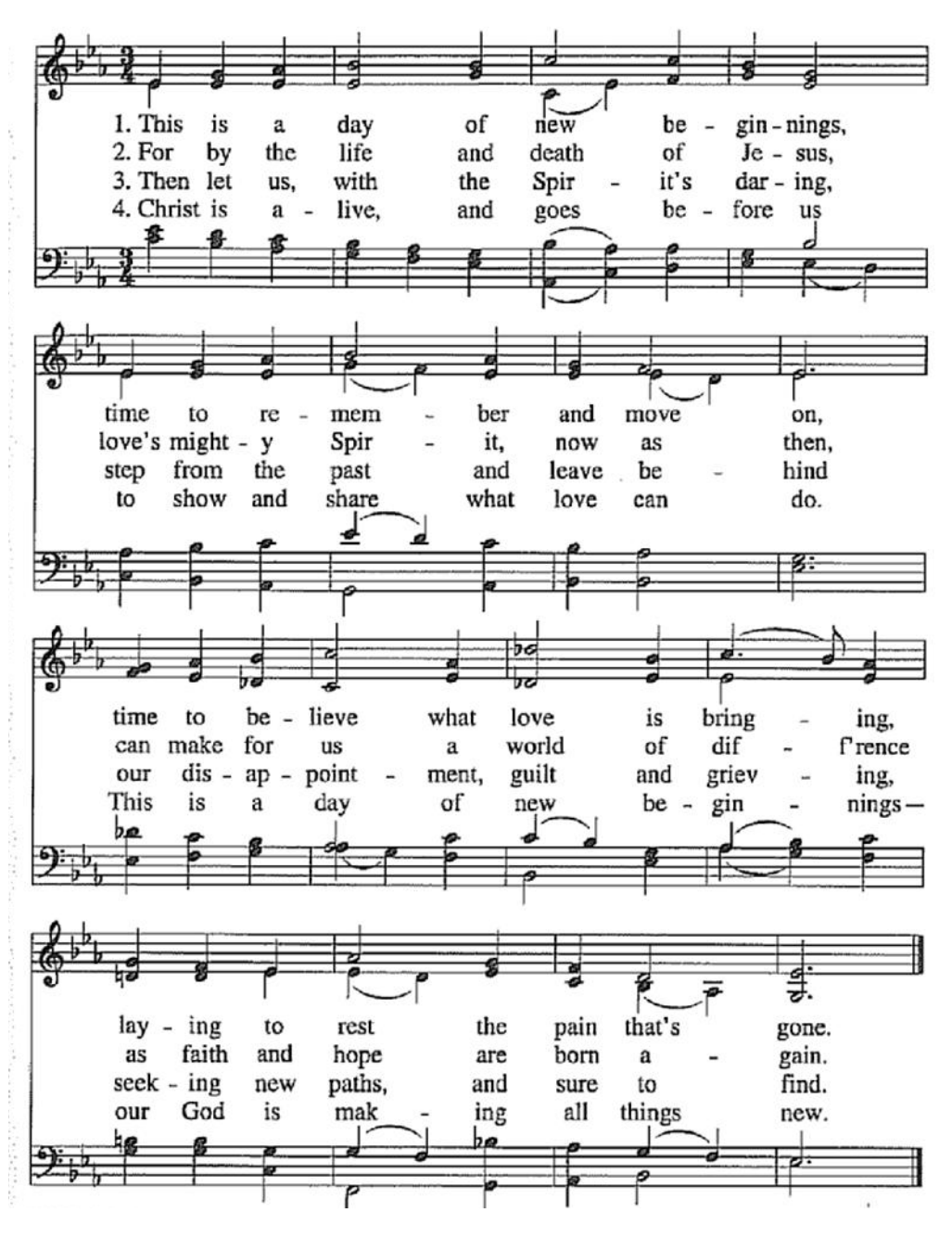
-Hymn Insert 4-