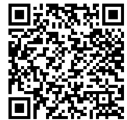
draft minutes of June 22 meeting